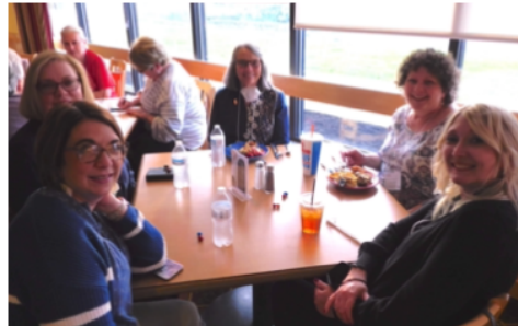
Members socialize during the 2022 Leadership Conference