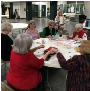
Beta and Alpha Iota members at their joint meeting in March