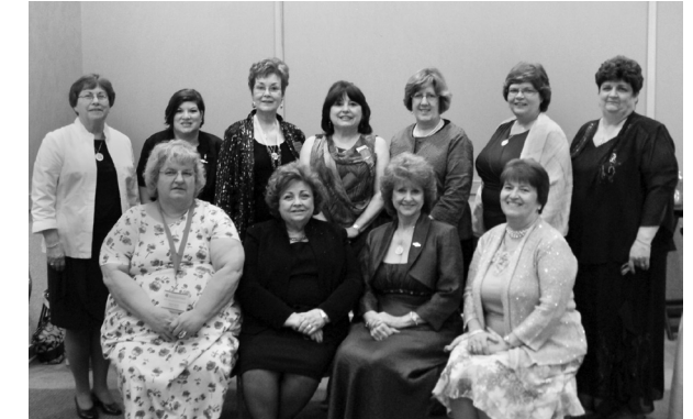
2013-15 Alpha Phi State Officers