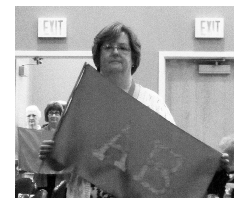
Presentation of Chapter Flags