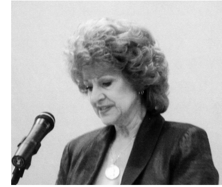
2013-15 President shares her vision for Alpha Phi State