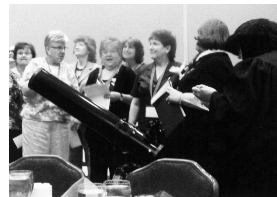
Delta Chapter extends invitation to 2014 Alpha Phi State Convention