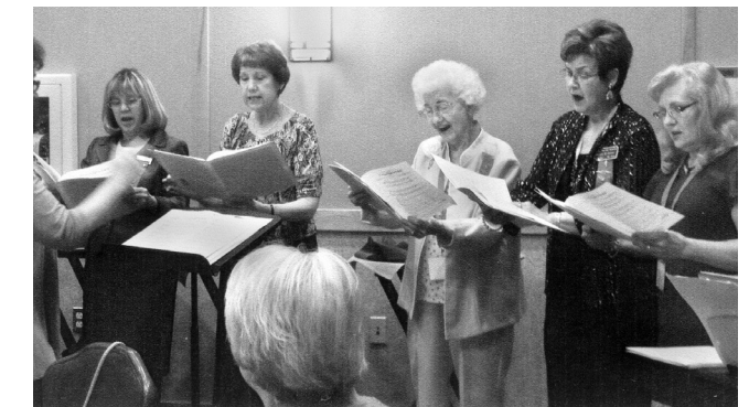
Alpha Phi State Choir performs at President's Banquet