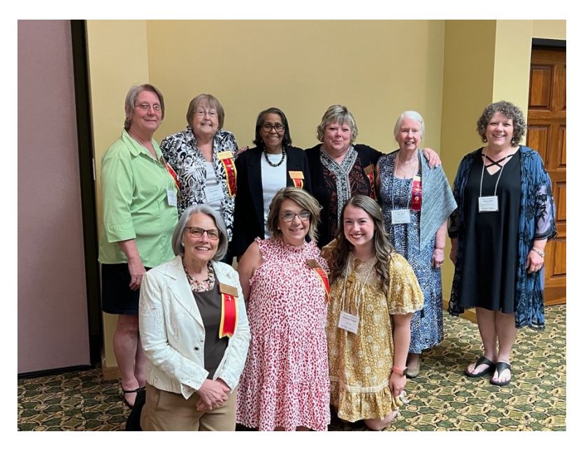
Beta Beta members and prospective members met at

I am super proud to say that Alpha Chapter had a large showing at the WV Convention in Flatwoods.