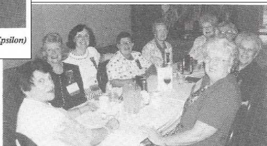
Members, from around the state, gather together for dinner.

The Newsette is published four times a year: Fall, Winter, Spring and Summer by the West Virginia State Organization of The Delta Kappa Gamma Society International.