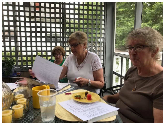
XI's Chapter meets to set goals for the year.

Every goal chosen should be reviewed for the outcomes that it will provide. Abandon goals that have no benefit to the membership