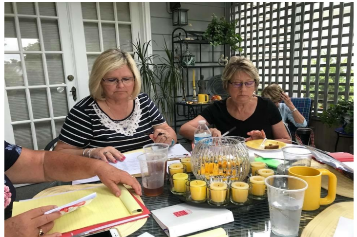
Setting goals for XI Chapter over the summer.

Goal setting research often talks about the steps of goal setting. Following these steps in your leadership meetings will ensure that your goal has