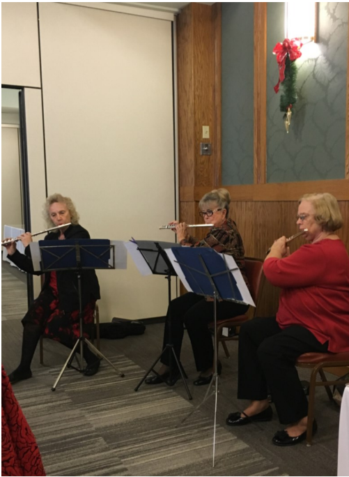
Beta Chapter's flute trio entertains their members.