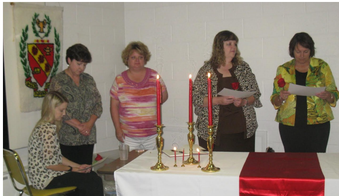
New Alpha Delta members and their sponsors at the fall meeting.