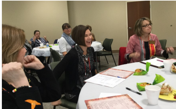
Eta members having fun at the December meeting.