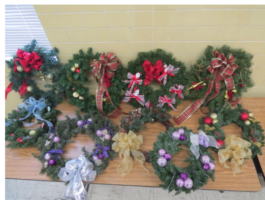
Several of the finished wreaths (above) made by Eta Chapter for residents of the assisted living facility.