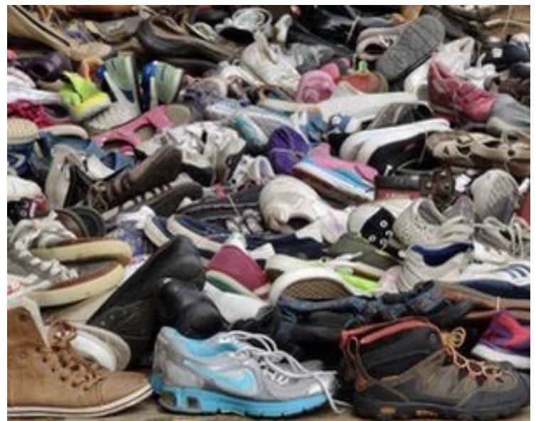
Shoes for sale on a street in Tibet.