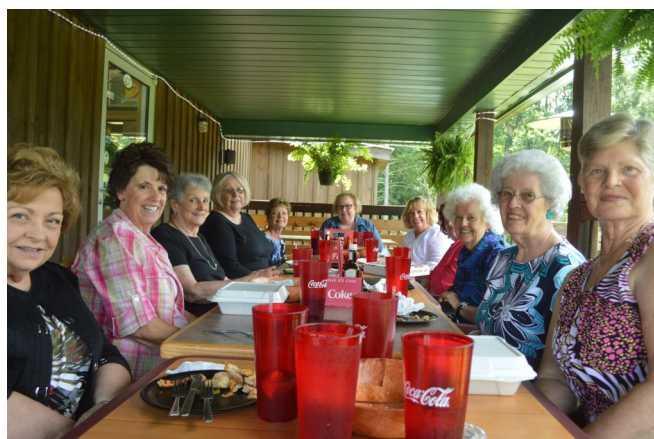
Nu Chapter sisters enjoyed an informal summer luncheon at the Long Point Grille near the beautiful Summersville Lake. They enjoyed good food, good company, and good conversa-