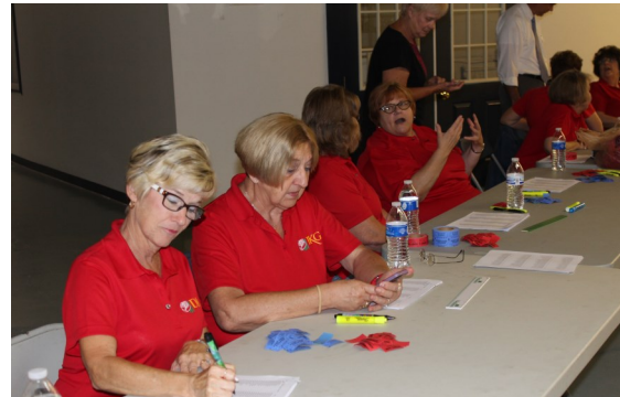
Alpha Mu members help at the Marshall County Fun Fair.