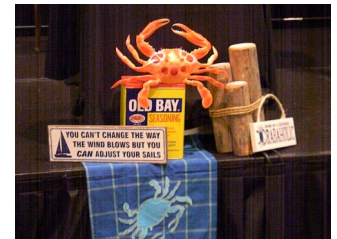
'Welcome to Baltimore' conference display.