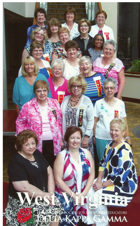
The West Virginia DKG delegation.

The next Northeast Regional event will be held in Ontario, Canada, in the summer of 2017. The exact dates and location will be announced at a later time. Just be sure your passport is up-to-date!