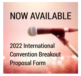
Present at 2022 Convention