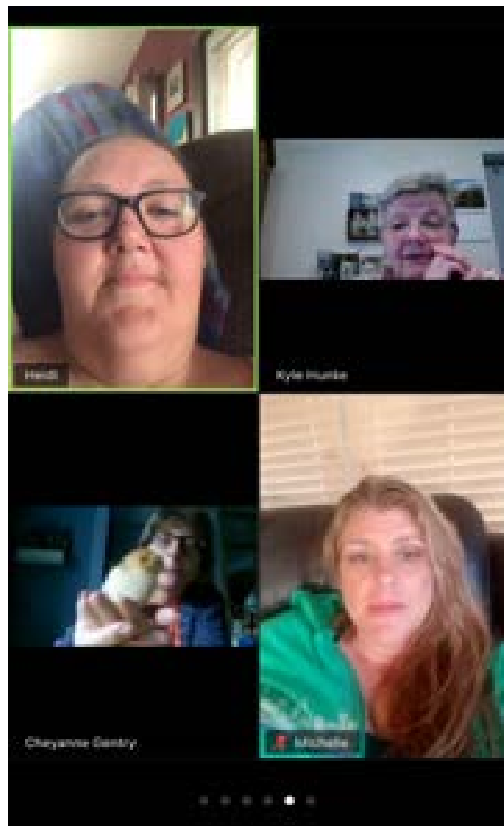
Photos provided from a chapter meeting via Zoom held in Colorado State Organization.