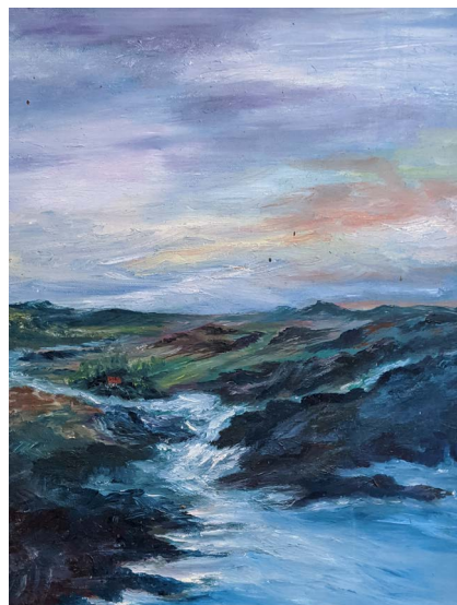
To the River © Oil by Suzanne Irwin, NC; featured in the 2020 Spring Fine Arts Gallery.